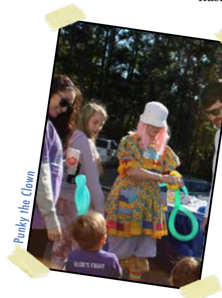
Punky the Clown