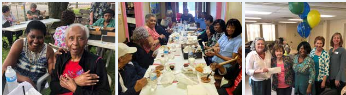
Below: As part of the check presentations to the day care centers ACA also provided a BBQ luncheon for participants, family members, and staff.